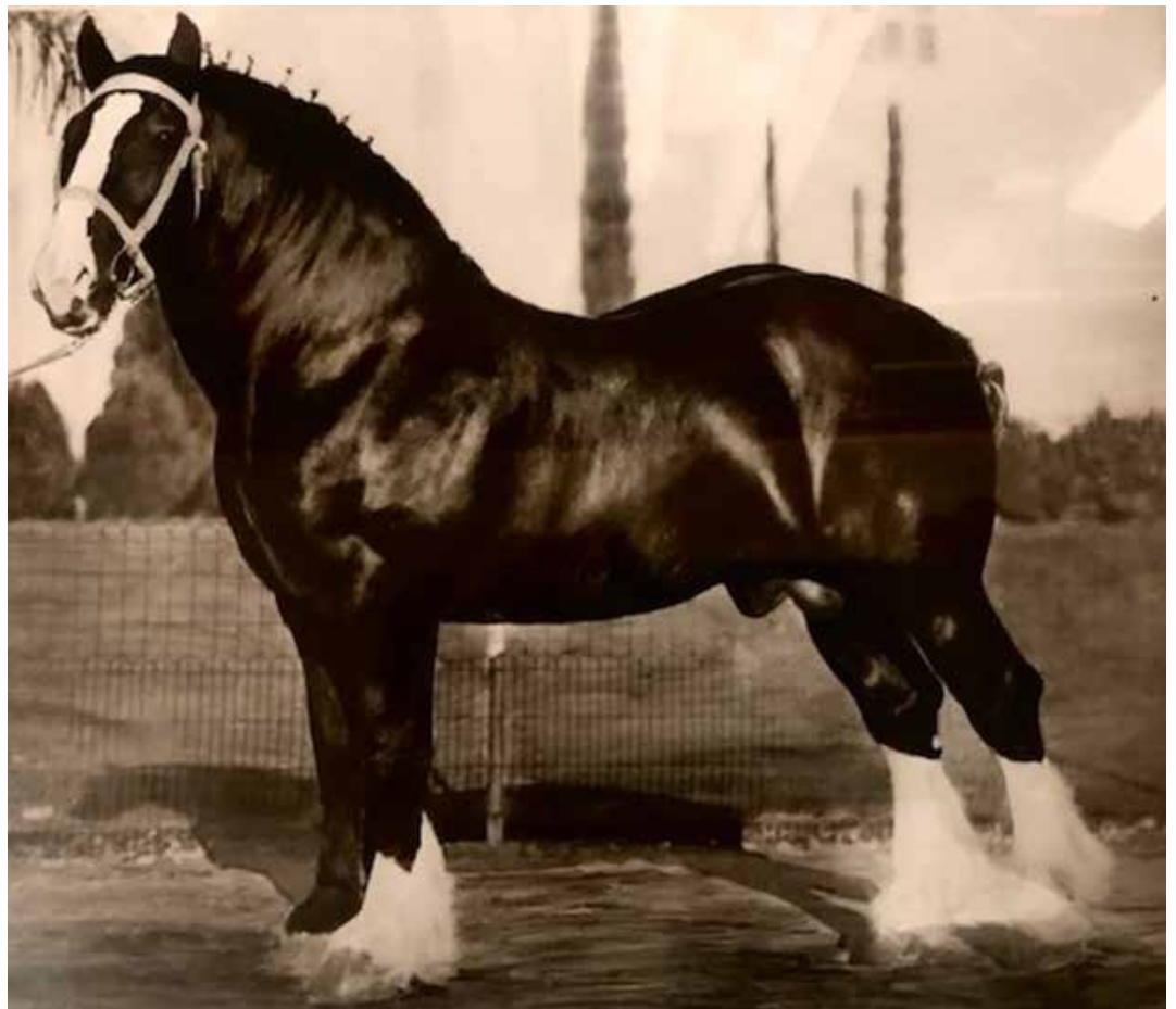
"Gallant Prince (20594)

It's important to pause for clarification; Bixby's horses and others of the era are often referred to as an 'Old American' type of horse in regard to confirmation and size. When do Shires stop being English and start being American? They don't really, because a registered Shire has bloodlines that reach back to the 1600's in England. The Shire is a native English breed that has