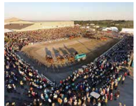
2014 HPD Mt. Hope, Ohio

2021 Horse Progress Days July 2-3 Mt. Hope Auction Grounds Millersburg, Ohio